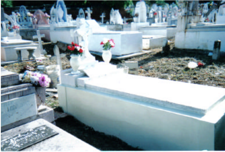
The tomb of Florencio Rivera—the family patriarch.